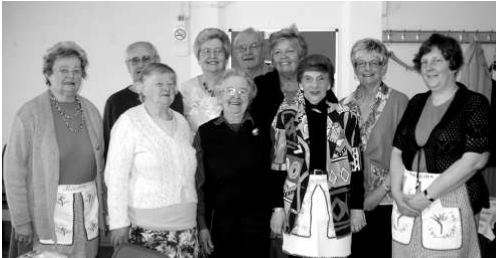
The Coffee Morning Workers