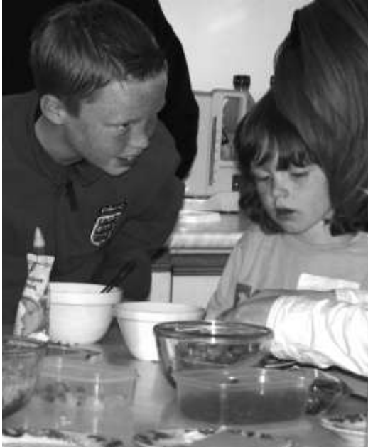
Cake making at last month's Good Friday activities.